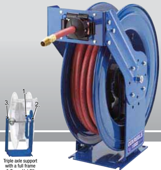
Triple axle support with a full frame & Super Hub™