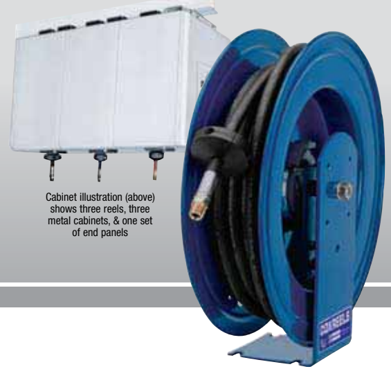
Cabinet illustration (above) shows three reels, three metal cabinets, & one set of end panels