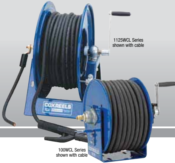
1125WCL Series shown with cable